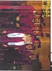
FBI classes have been held in churches in 47 US states and on 7 continents!

"FBI is my favorite thing to do!" - Louisiana Student